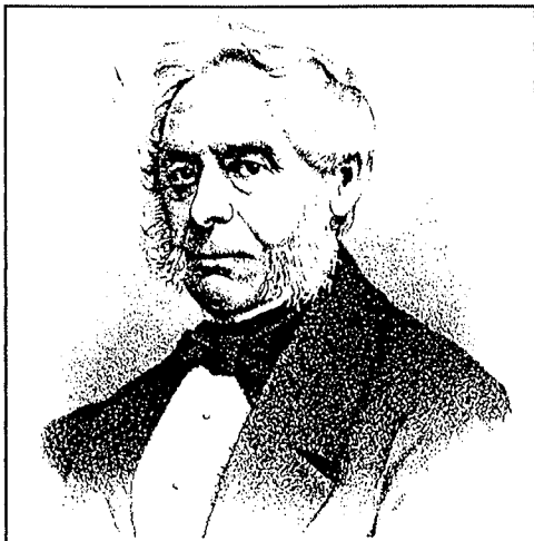
William Hamilton Merritt.